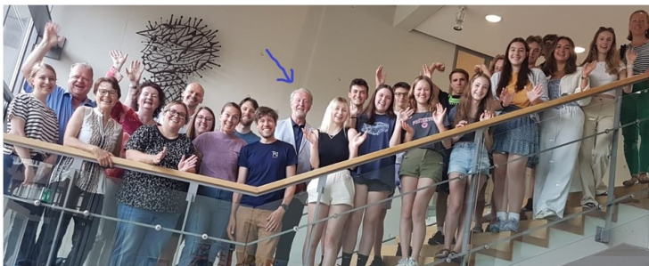
2023, with York students in Leinfelden-Echterdingen

Twinned with: Arles, France (Since 1954)