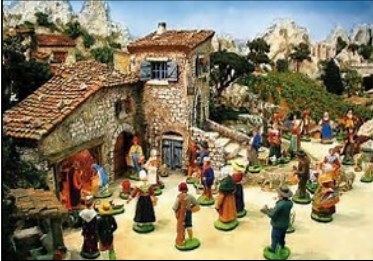
Typical Provençal crèche featuring village buildings and townspeople. Note detailed facial features in photo at right.

SANTONS (Provençal: "santoun" or "little saint"), are small hand-painted terracotta nativity figurines produced in the Provence region of southeastern France. In a traditional Provençal crèche , there are 55 individual figures representing various characters from Provençal village life such as the scissors grinder, the fishwife, the blind man, and the chestnut seller.