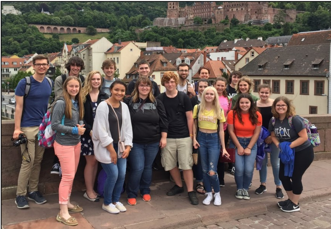
York County students are all smiles as they tour Germany on an exchange visit.

Students from six different high schools in York County participated in a York Twinning sponsored exchange program by traveling to Germany during the summer of 2017. In a previous switch, their German student hosts had journeyed to York for an equally unique experience during the fall of 2016. At the November 28th membership meeting of York Twinning Association, students who participated will share their observations and enlighten everyone with insightful chatter about enculturation and life in a foreign country. Please attend the presentation and be in awe with the remarkable feedback of our program accomplishments.