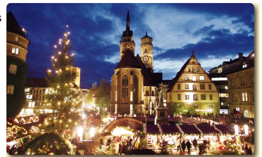
With snow, Stuttgart is a winter wonderland!